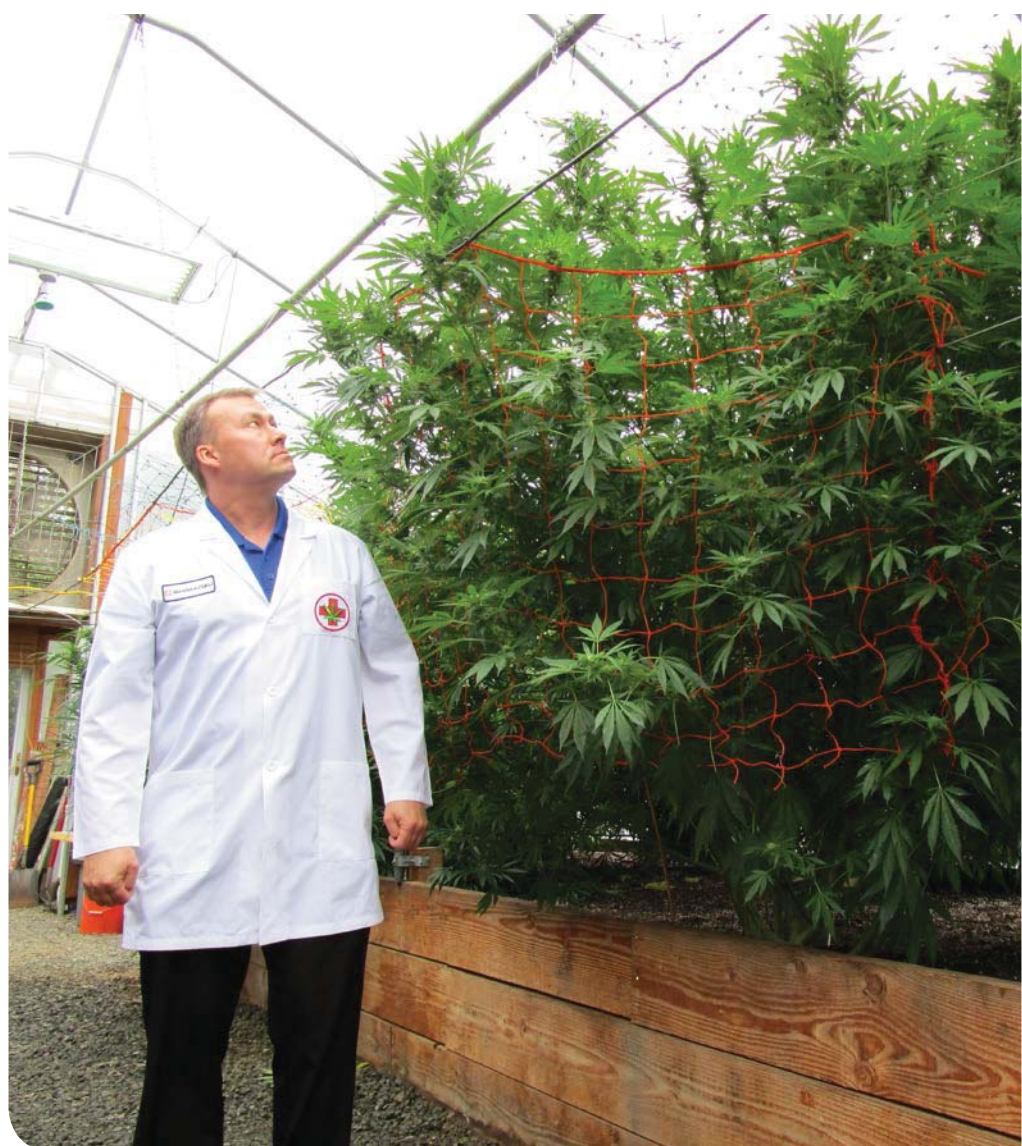
Fig. 1. G.I. Grow's natural sunlight biomedical farm (www.GIGrow.us).

Standardization of testing and sample preparation is critical to ensuring safe products. For example, cannabinoid extraction from cannabis plant materials selectively separates cannabinoids, ultimately delivering them in a highly concentrated form. Concentrated oils and waxes are used to generate a wide variety of cannabis infused products, from gummi bears, brownies, and beverages to soaps and skin creams. Accurate testing of cannabis oils and products is necessary to ensure proper dosing and to minimize the risk of overdose. In addi-